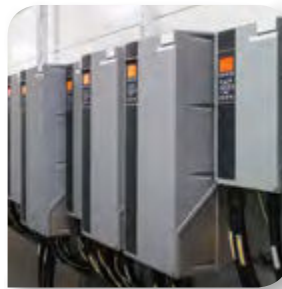
ELECTRICAL & ELECTRONICS

Our customers include global manufacturers and OEMs in industries such as: Electrical products, Electronics, Automotive, Medical, Appliances, Industrial, Aerospace, and much more.